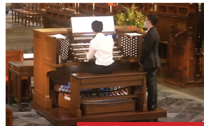
St John's first ever online recital live webcast on YouTube on 2nd August

So not everything about our current predicament is negative. As so often, what seems like a problem reveals itself as an opportunity. Let's hope and pray that we can return to some semblance of normality before too long.