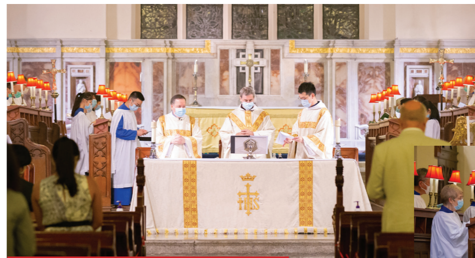
Cathedral Choir singing at the Sung Eucharist for the Feast of the Visitation in a social distancing manner