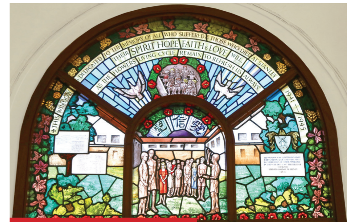
The memorial window in St Stephen's Chapel Stanley

So the virus has not only disrupted the life of the church and all our lives; it has also encouraged creative new ways of being church.